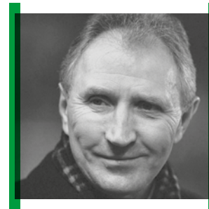
>> HOWARD WILKINSON

LMA Non-Executive Director Jeremy Snape has the combined experience of being a successful international cricketer and coach to provide innovative performance ideas for teams and leaders. He has the ability to draw upon real life examples from his playing and coaching career which are underpinned by his Master's Degree in Sport Psychology.