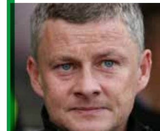
>> OLE GUNNAR SOLSKJÆR

For any aspiring coach or manager, this course is a MUST! I wish I could do it all over again.